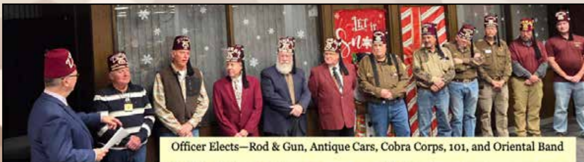
Officer Elects—Rod & Gun, Antique Cars, Cobra Corps, 101, and Oriental Band