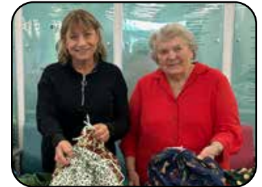
Auxiliary ladies at the Shrine clinic distributing blankets and Christmas bags.