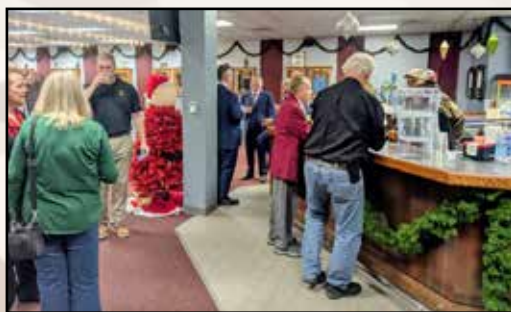
The Oasis was a busy place during the Christmas party/Installation.

Being a Shrine clown means making a real difference by doing something joyful, proving that laughter truly is a form of kindness.