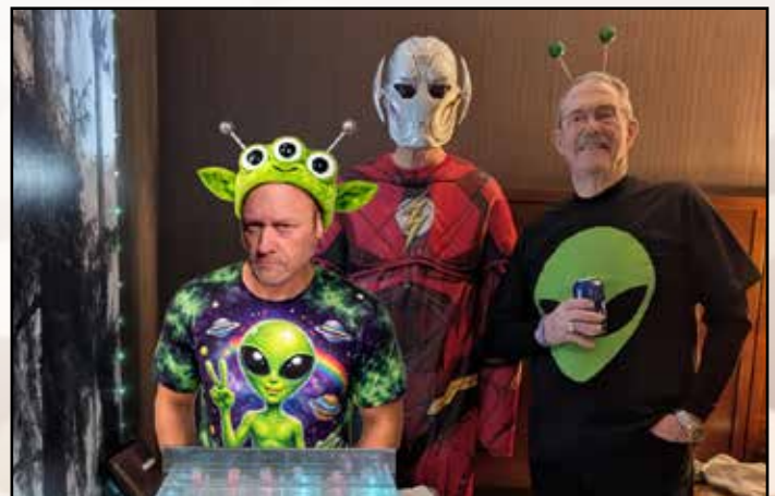
Minnow races at the Ball.