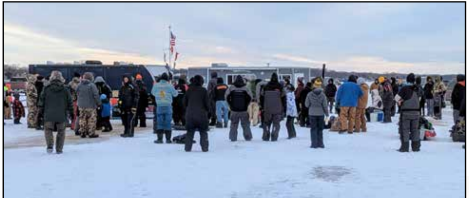
Participants at Holes 4 Heroes during awards time. February 7th 2026.