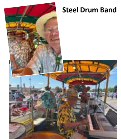
Steel Drum Band