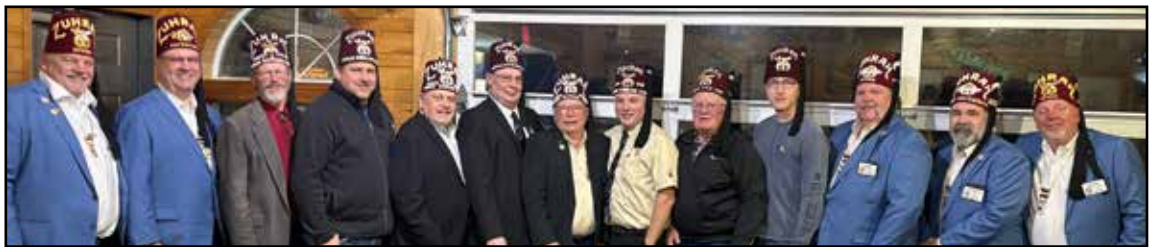
Officer Installation Night January 24, with several members of the Divan in attendance.

Cold temperatures seem to be the norm when we have our Officer Installation/Christmas Party. Despite the below zero night, 36 members and guests attended, including several Divan members. A lively gift exchange followed the installation, with plenty of fun and laughs.