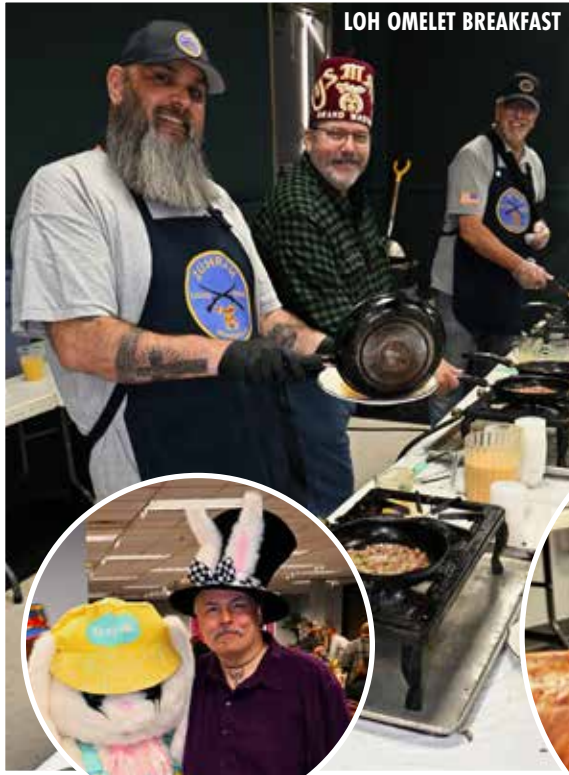
LOH OMELET BREAKFAST